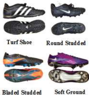
Fig. 6. The four categories of shoes tested

The four remaining turf samples (Gym Turf, Old Turf, New Turf 1.0" and New Turf 1.5") were tested in two sets since the New Turf sample first had to be tested with 25 mm (1.0") rubber infill and then 38 mm (1.5") rubber infill (40 tests per set). This was accomplished by randomly testing half of the Gym Turf and Old Turf samples with all of the New Turf 1.0" samples in the first set, then testing the remaining Gym Turf and Old Turf samples with all of the New Turf 1.5" samples. The shoes being tested were switched after every five trials and the playing surface samples were randomly alternated. The shoe testing was organized in a way where once again, the same shoe would not be tested after another type of shoe every time.