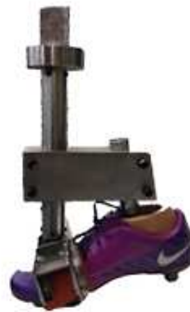
Fig. 2. The fixture used to anchor the foot form to the bi-axial servo-hydraulic load frame. The fixture allows all the load to be transmitted through the forefoot in accordance with ASTM standards

The natural turf used in this study was Kentucky Bluegrass grown in wood boxes (referred to as Grass Boxes) that contained 50 mm (2 in.) of soil and a wire mesh to help anchor the grass roots (Fig. 4). Due to time considerations, the grass samples had a limited time to grow. Wire mesh was incorporated so the roots could grow through the mesh and help anchor the grass samples to better simulate actual playing surface conditions. The grass samples were watered daily and cut weekly. A special box with a hinged side was created, so root development could be monitored. The roots were fully developed before testing which was seen by the lack of new white colored roots.