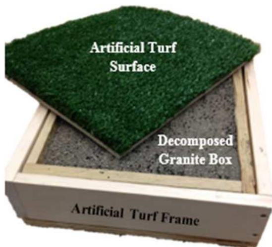
Fig. 5. Shows how the artificial turf frame fits around the decomposed granite box. Note that the shown picture is before the artificial turf surface was nailed to the frame. This whole setup fits inside the mounting box for testing

Since there was limited space to store and grow the grass samples, the experimental set-up was designed in such a way that one grass sample could be tested four times. This was achieved by rotated the grass boxes in the mounting box by 90° after each test. This subjected an untested section of grass to torque without changing out the Grass Box.