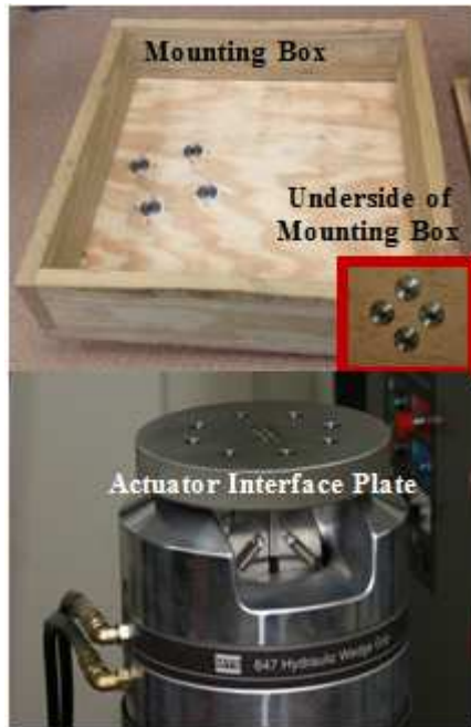
Fig. 3. The Actuator Interface Plate and Mounting Box designed to transfer torque from the hydraulic actuator through the turf to the shoe during the experimental trials