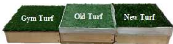
Fig. 7. The artificial turf surfaces attached to wood frames for testing. Note that the shown New Turf sample was tested with 25 mm (1") and 38 mm (1.5") deep rubber infill