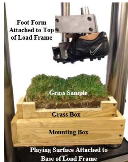
Fig. 1. Experimental set up showing a round studded cleat and grass playing surface sample installed in the bi-axial servo-hydraulic load frame

Both natural and artificial turfs were evaluated in this study. For the natural turfs, Grass Boxes were constructed to fit into the Mounting Box and allow the turf to grow and root as it would on a natural playing surface. For the artificial turfs, Artificial Turf Frames needed to be constructed that fit into the Mounting Box and allowed the artificial turf surface to be mounted in a manner similar to that of an actual playing surface.