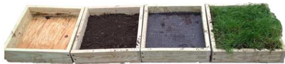
Fig. 4. The process followed to make the grass samples consisting of a wood box filled with 50 mm (2 in.) of soil, a wire mesh and Kentucky Bluegrass sod