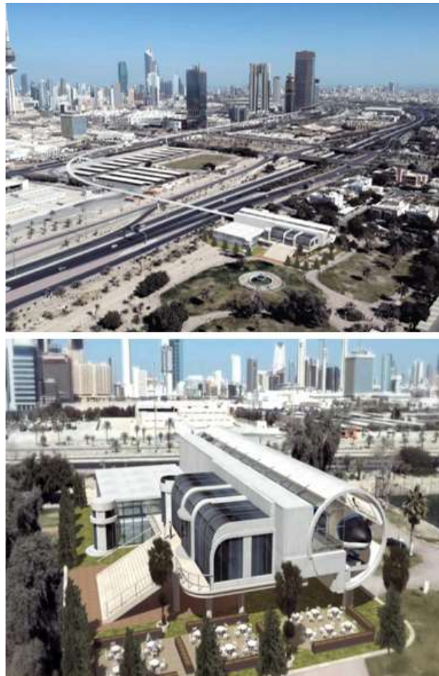
Fig. 3: Layouts of planned station location