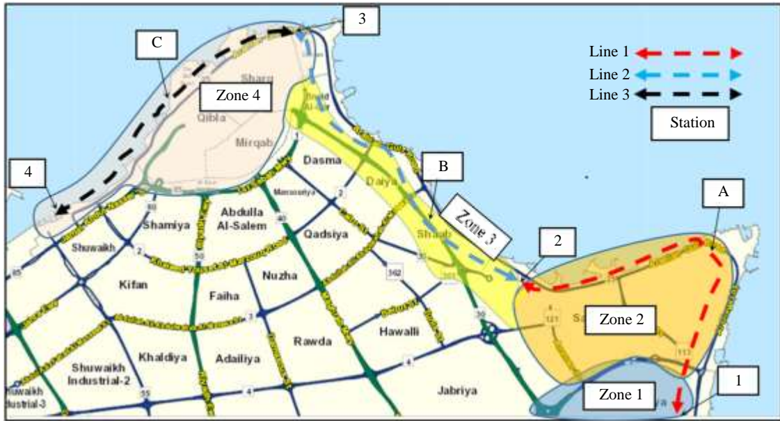
Fig. 4: Proposed monorail route and trip generation zones for Arabian gulf street