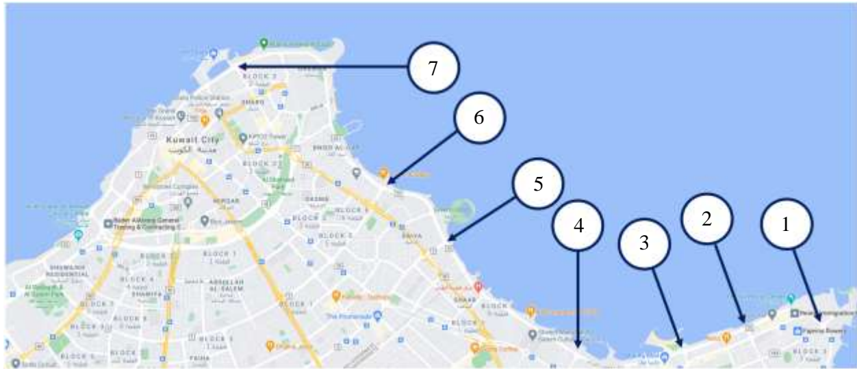
Fig. 6: Selected intersections for LOS analysis