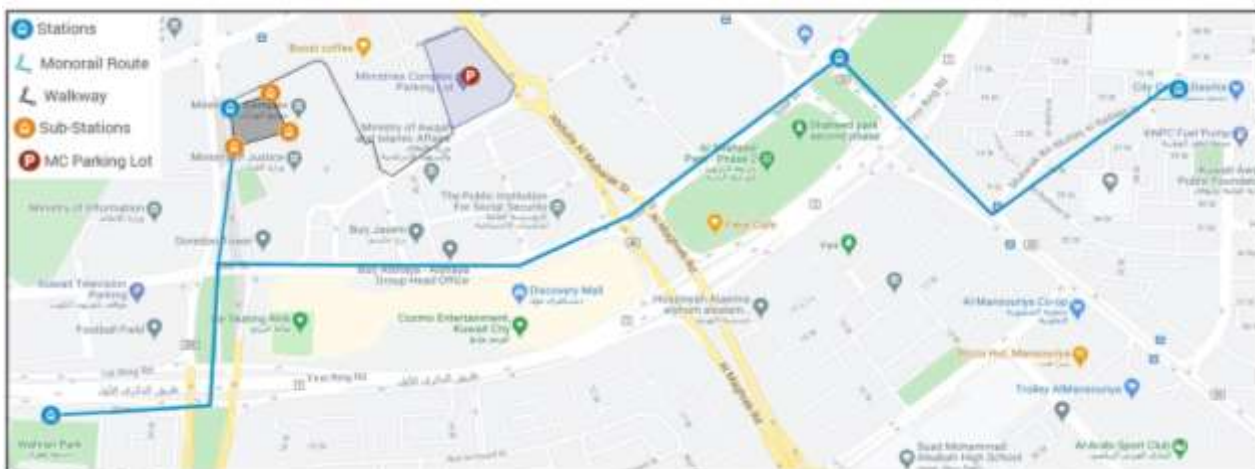
Fig. 2: Overview of the proposed monorail route and stations for the first location

The locations of stations were carefully selected to provide an efficient guide and friendly access for passengers with consideration to the rules of safety and comfortable transfer. Proposed stations are elevated and serviced by staircases and escalators. Additionally, the proposed locations provide easy connection with other modes of transportation and nearby residential, business and commercial areas and public service facilities. Figure 3 shows an overview of how the proposed station should look like.