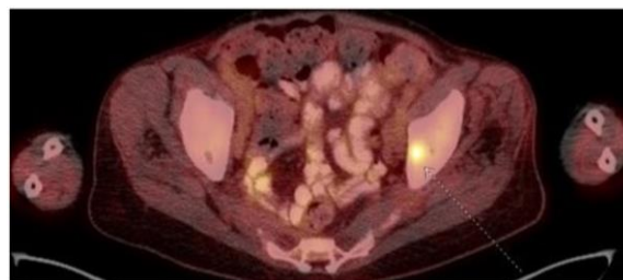
Fig. 2: Left ilium, PET image. The metabolically active osteolytic lesion demonstrated in the left iliac bone thought to be consistent with CLL progression