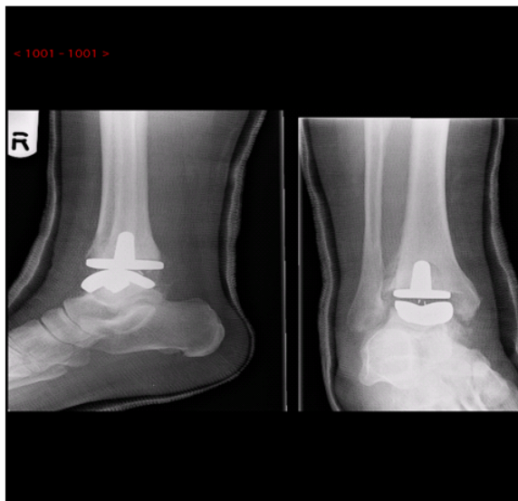
Fig. 5. Radiographs indicating proper alignment of implants