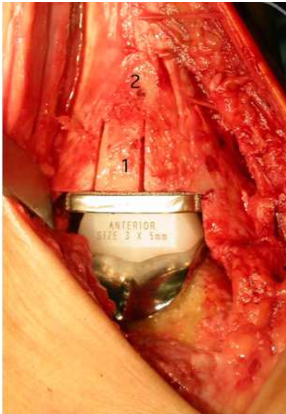
Fig. 4. Per-operative final position of the implants with plastic spacer in between