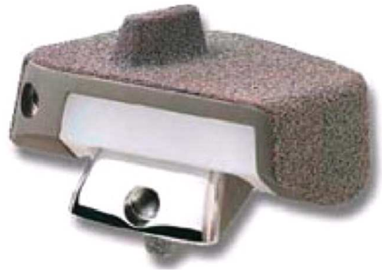
Fig. 1. Two-component total ankle replacement: Agility ankle

The two-part designs such as the Agility ankle are semi-constrained devices containing a large tibial component and a smaller talar component into which the modular polyethylene inserts lock (Fig. 1). In addition, the Agility ankle required the concomitant fusion of lower tibio-fibular syndesmosis. The results of two-part Agility ankles were promising with up to 80% survival at 4.8 years (Pyeovich et al. , 1998).