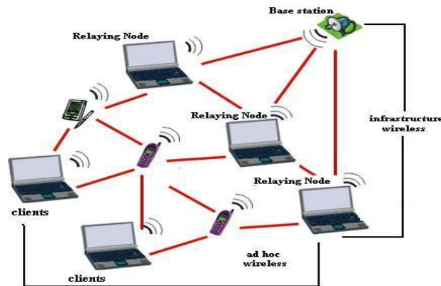
Fig. 1: Multihop Wireless Hotspot Network

In order to connect to the base station, the faraway nodes may rely on the intermediate nodes to forward their packets. This is the multihop wireless hotspot network proposed in recent literatures [9,10]. It is a hybrid network consisting of infrastructure and ad-hoc networking components. We consider a multihop hotspot network as illustrated in Figure 1. In this architecture, a mobile client may not be able to reach the base station (BS) via single-hop direct communication. Instead, the client must rely on another node who is closer to the BS to forward its packets. Such nodes are called the relaying nodes (RN).