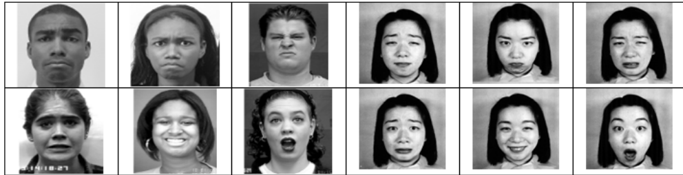
Fig. 1: Sample expressions from Cohn-Kanade database and JAFFE database