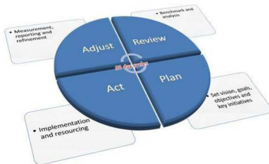
Fig. 1. Strategic plan