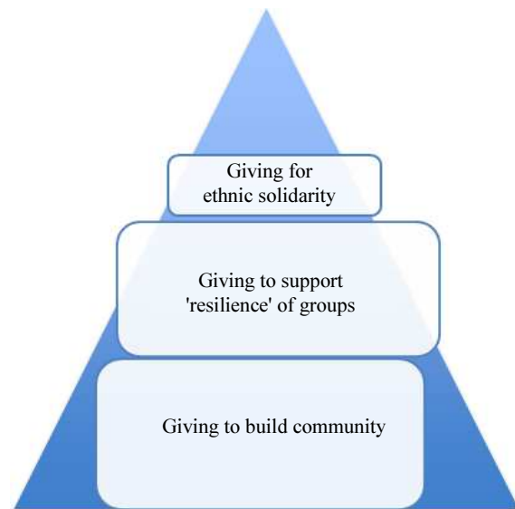
Fig. 2: Hierarchy of motivations- Remittances and philanthropy