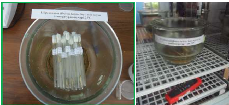
Fig. 1: The breeding of Bracon imagines at a temperature of 25-35°C in a thermostat