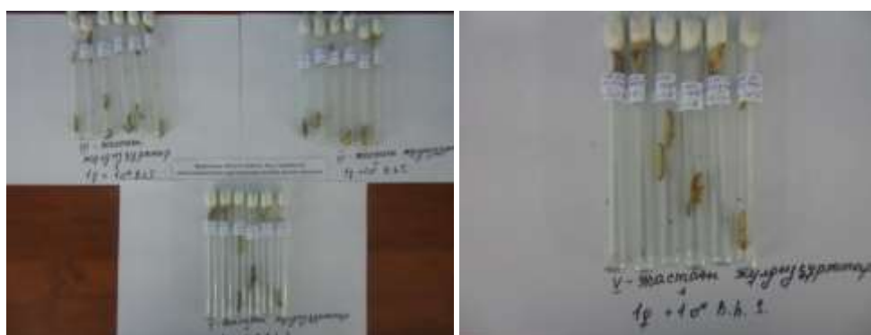
Fig. 4: The experiment to determine the age of the laboratory host: Caterpillars of the greater Galleria mellonella